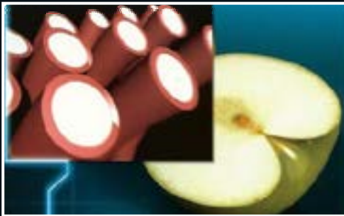
Post dyed - colour is skin deep

With solution dyed nylon, the colour pigments are locked into the molecular structure of the fibre, unlike post-dyed fibres where dye colour is only surface deep.