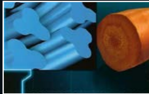
SDX - colour to the core